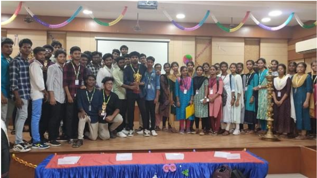
Our College Students Secured the first prize and Won Overall Trophy in K.Ramakrishna College of Engineering at Trichy.